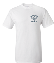
WHITE TEE FRONT ONLY PRINT