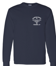
STAFF NAVY LONG SLEEVE