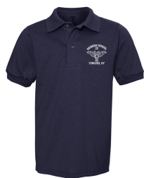
YOUTH NAVY POLO