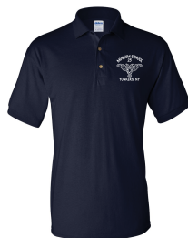
STAFF NAVY POLO