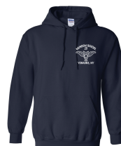
NAVY PULLOVER HOODIE FRONT ONLY PRINT