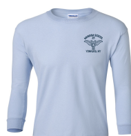
YOUTH LIGHT BLUE LONG SLEEVE