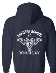
NAVY HOODIE BACK ONLY PRINT