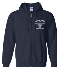
NAVY ZIP HOODIE FRONT ONLY PRINT