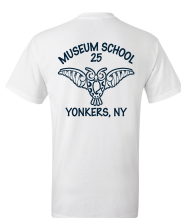
WHITE TEE BACK ONLY PRINT