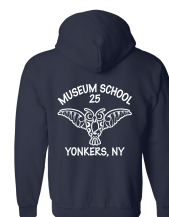
NAVY PULLOVER HOODIE BACK ONLY PRINT