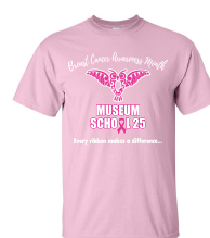
BREAST CANCER AWARENESS PINK TEE