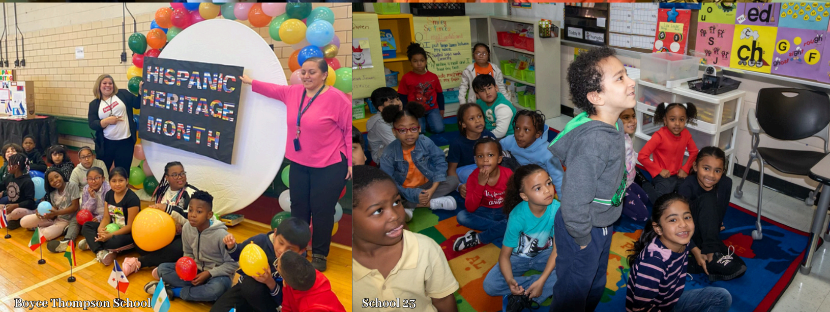
Boyce Thompson School