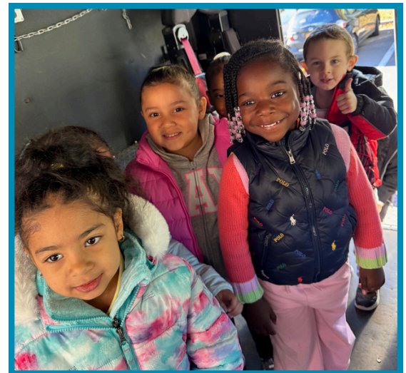
Students at Yonkers Early Childhood Academy Engaging in Fire Safety Activities

P.S. A reminder for families, Wednesday, October 23rd is a Superintendent's Conference Day and will be a half day of school for all students.