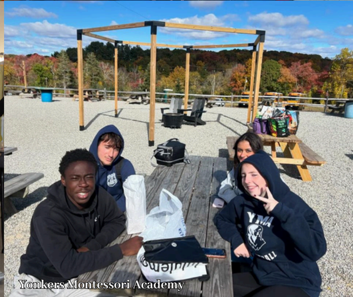
Yonkers Montessori Academy