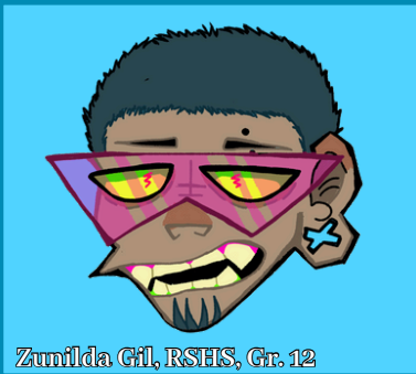
Zunilda Gil, RSHS, Gr. 12