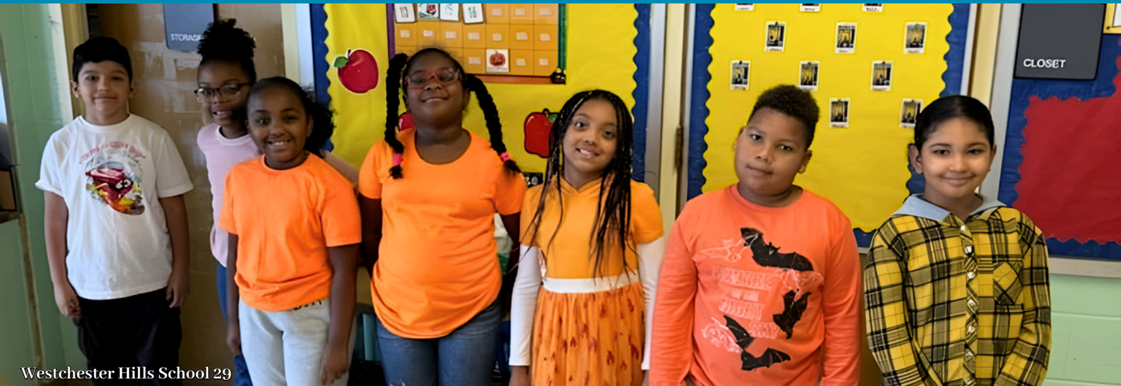
Westchester Hills School 29