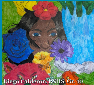
Diego Calderon, RSHS, Gr. 10