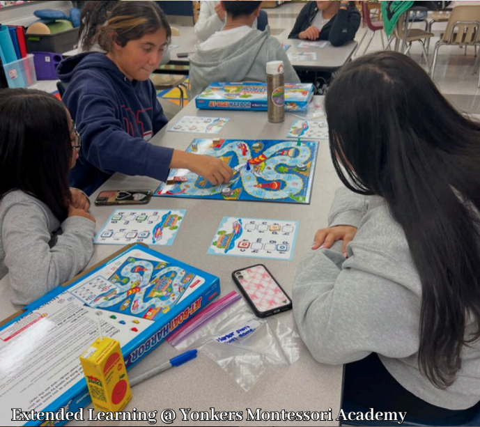
Extended Learning @ Yonkers Montessori Academy