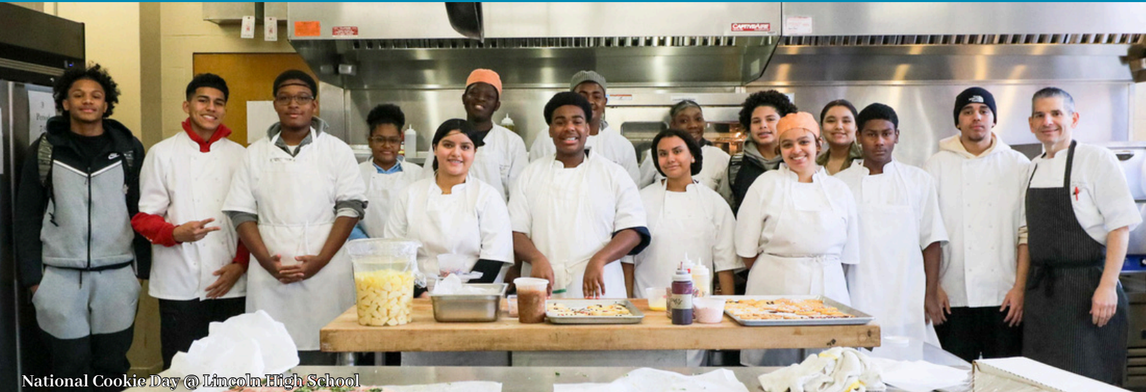
National Cookie Day @ Lincoln High School