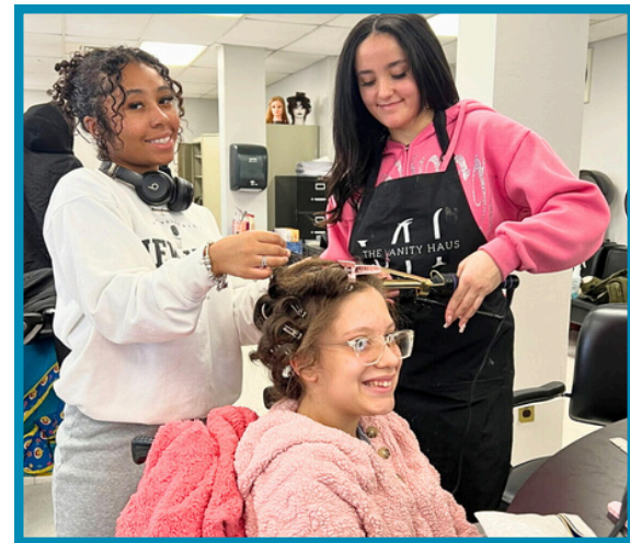
Saunders Trades & Technical High School Cosmetology Seniors at the Annual Day of Beauty for Cerebral Palsy of Westchester