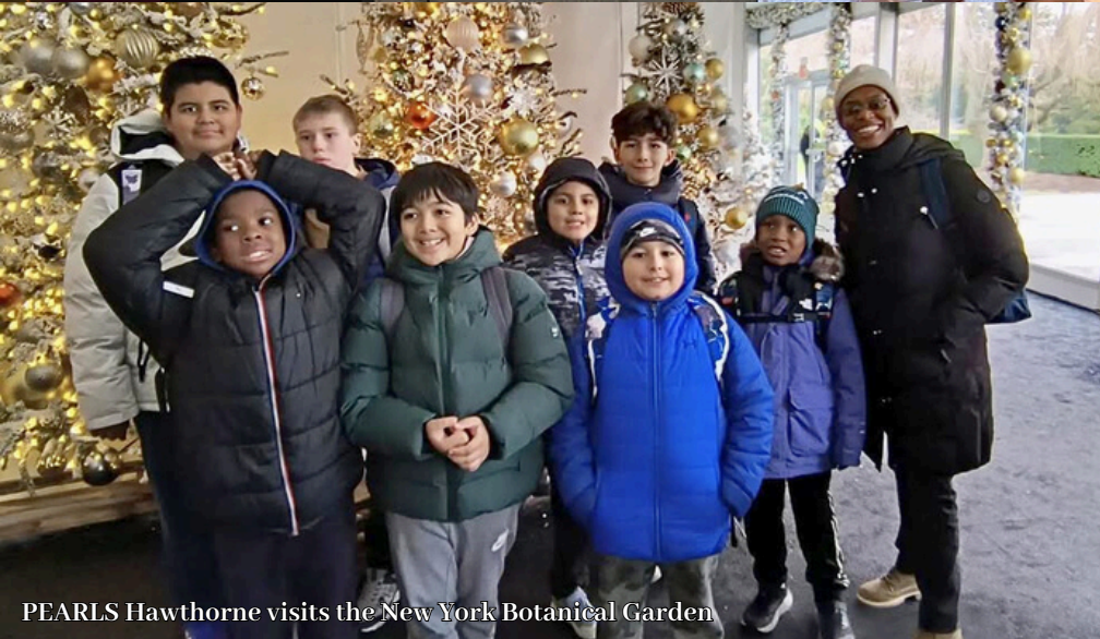
PEARLS Hawthorne visits the New York Botanical Garden