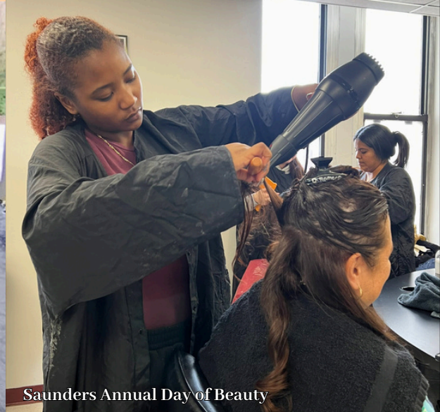
Saunders Annual Day of Beauty