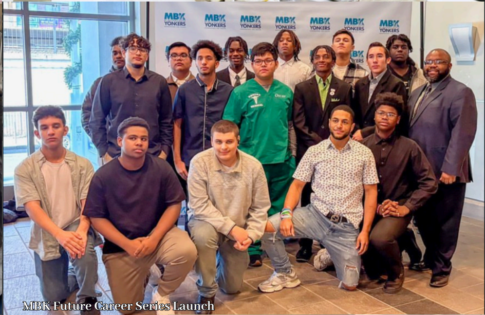
MBK Future Career Series Launch