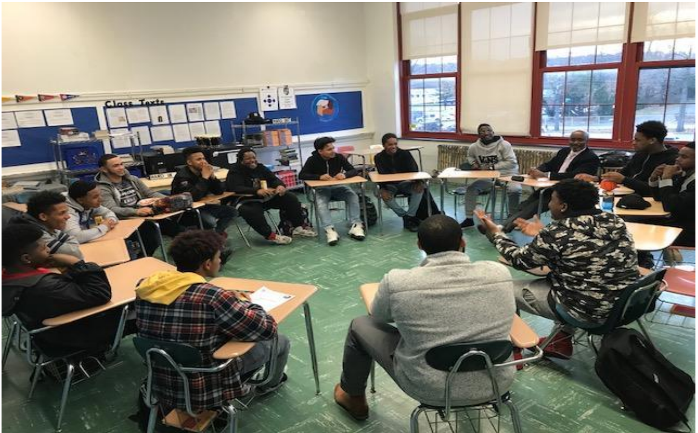
Our restorative circle: We were discussing how certain games can increase our mental agility.