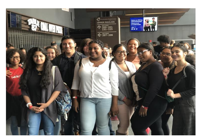
Students participating in WE Day