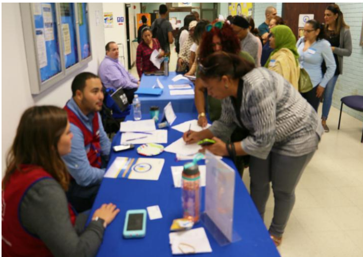
Among the many employers who students had the opportunity to apply with were Lowe's and St. John's Riverside Hospital.

Attended by more than 350 students and members of the community, this event was the eleventh job fair which has been held here at the Vive School. In attendance were some of the area's largest employers. Students had the opportunity to interview with these employers, and also to apply for positions online in our Computer Lab.