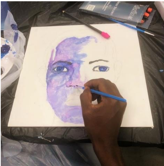
Beautiful artwork created by students in Ms. Gray's Friday Art Class.

“Sometimes we also focus on art forms from the students’ native countries. For example, one day we celebrated the Mexican tradition of the “Day of the Dead,” and we made paper flags known as “papel picado. “The bottom line is, we are having fun!”