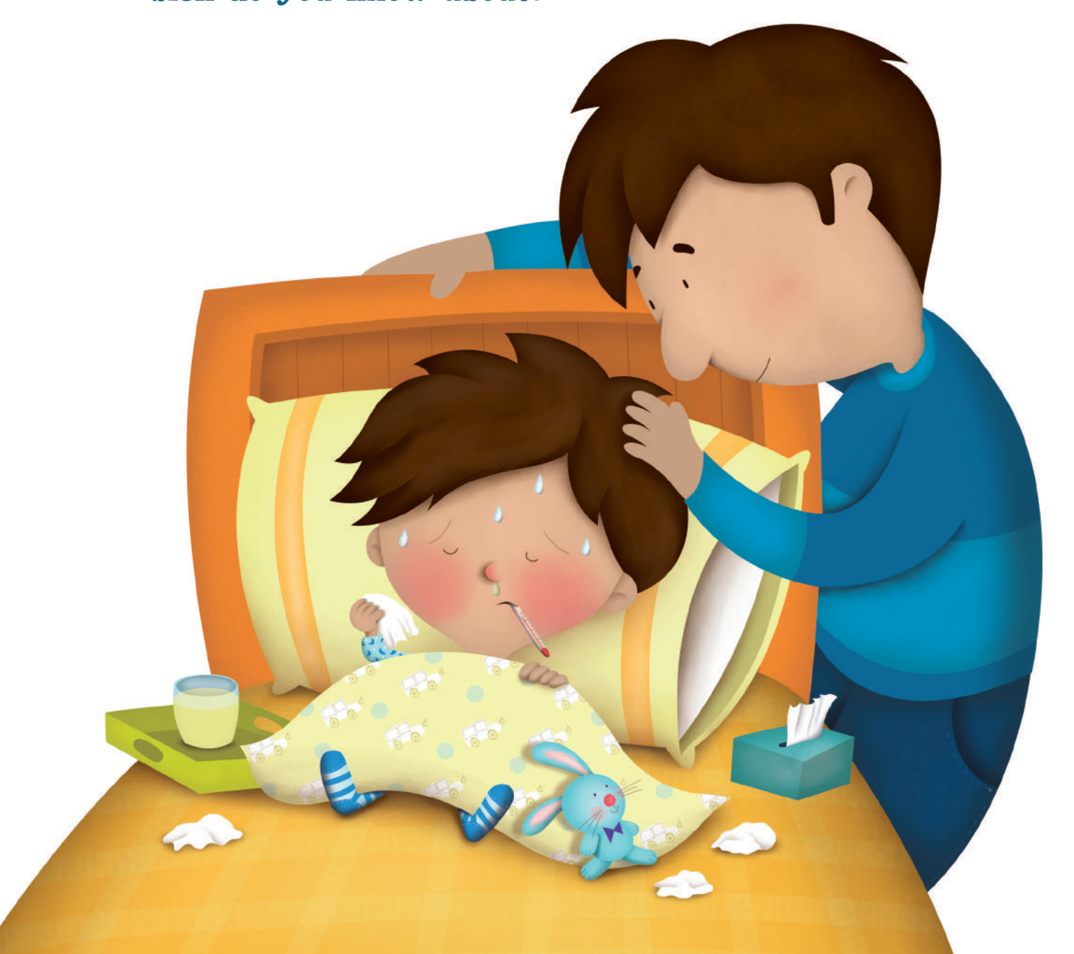
What other ways to be sick do you know about?

You probably already know a lot about different ways to be sick. You may know about colds , when you cough and sneeze a lot. You may know about strep throat , when it hurts to swallow, or ear infections , when your ear hurts inside.