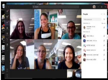
What our meetings look like now !!?!?!

The Sophomore Teachers have found a great way to develop a strong relationship with the students. To get them motivated some of the Teachers hold open forum meetings, that allows them to express their feelings and things that are going on in their world.