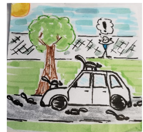
The Skunk family first day of school

The 9 th grade team celebrated their Top 25 Freshman students at their first Top 25 Virtual Breakfast. The 9 th grade team of teachers submitted video messages for the students, congratulating them on their achievements. It was a very successful celebration, and we look forward to doing it again for the second quarter. Congratulations to our 9 th grade Smart Scholars and PTECH students!